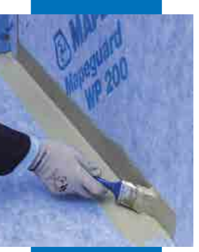
Application of the Mapeguard WP Adhesive in order to seal the joints in the corner before the application of Mapeguard ST