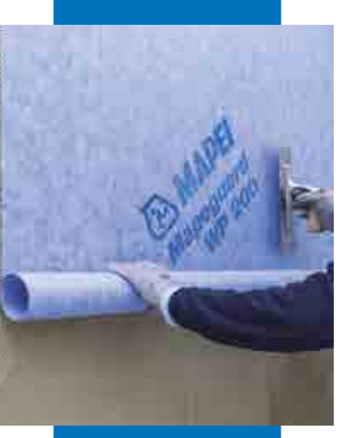
Laying Mapeguard WP 90