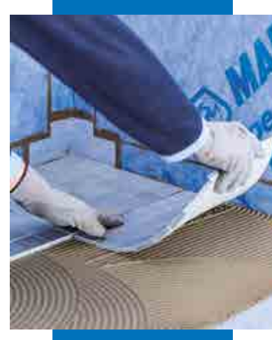
Laying of the tiles