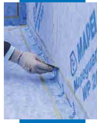
Application of Mapeguard ST