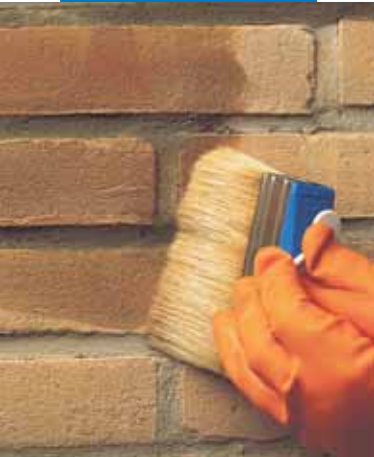
Applying Antipluviol S by brush