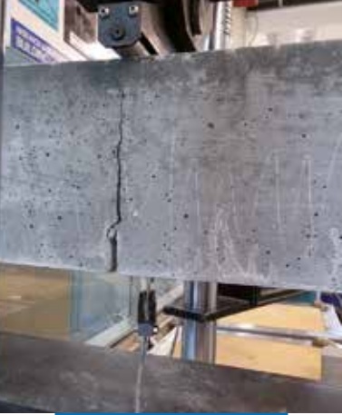
CMOD controlled bending test in compliance with EN 14651 standards