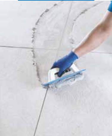
Application of Keracolor GG with MAPEI float