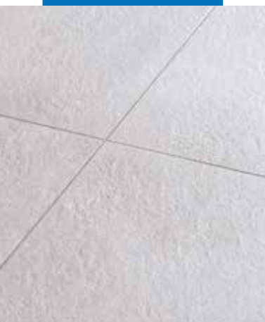
Floor grouted with Keracolor GG