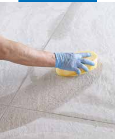
Cleaning and finishing grouts with hard cellulose sponge